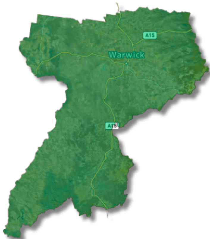
Total Visitors - people seen in an area who had to travel more than 50 kilometres during December.